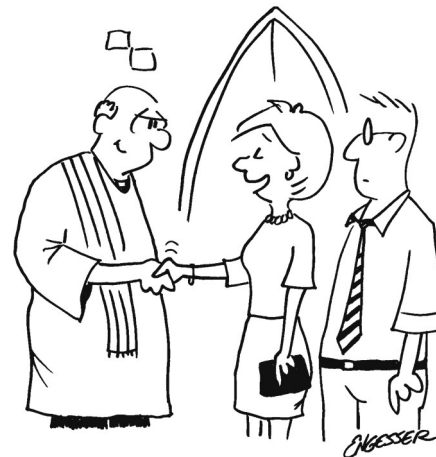
"The heart-shaped communion wafers were a nice touch for Valentine's Day."